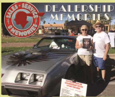
ALBINGER PONTIAC • SAUKVILLE, WISCONSIN